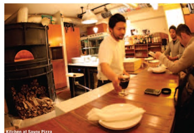
Kitchen at Savoy Pizza

For a once in a lifetime sushi experience, go to Matoi Sushi (Roppongi 7-8-13, tel: +81 3 3404 6051). There is no fridge and Chef Matoi uses blocks of ice to keep his fish fresh. It is very expensive but extremely good.