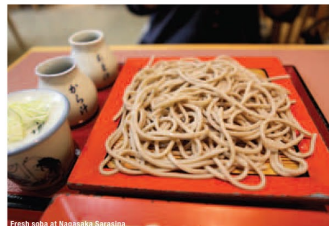
Fresh soba at Nagasaka Sarasina