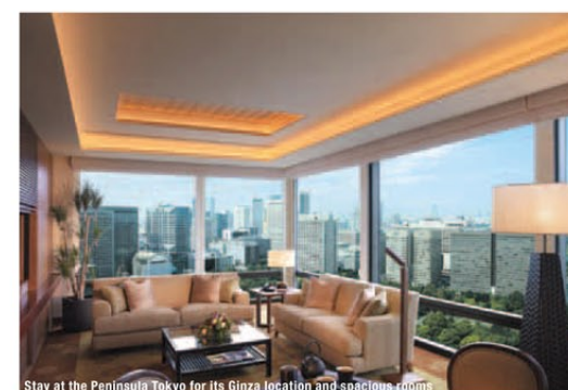
Stay at the Peninsula Tokyo for its Ginza location and spacious rooms