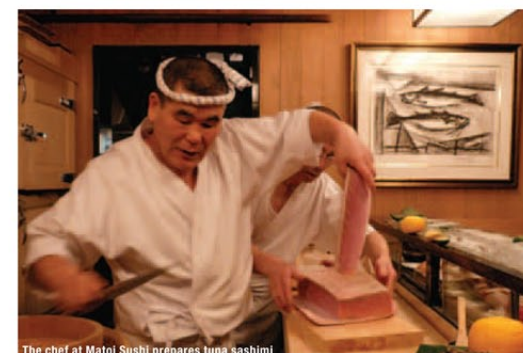
The chef at Matsui Sushi prepares tuna sashimi