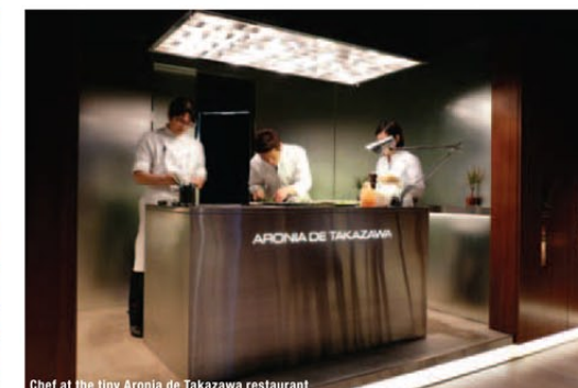
Chef at the tiny Aronia de Takazawa restaurant