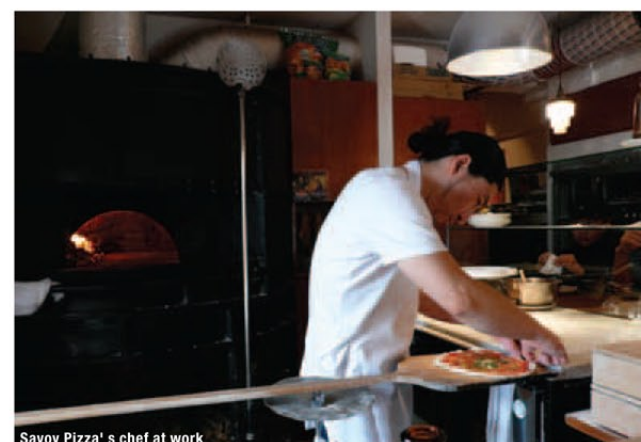
Savoy Pizza's chef at work