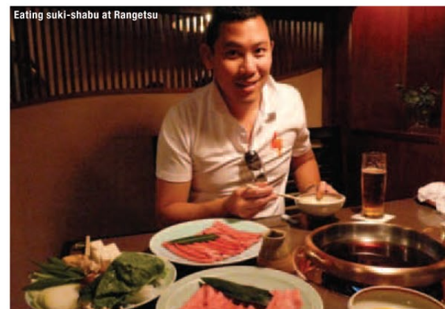
Eating suki-shabu at Rangetsu